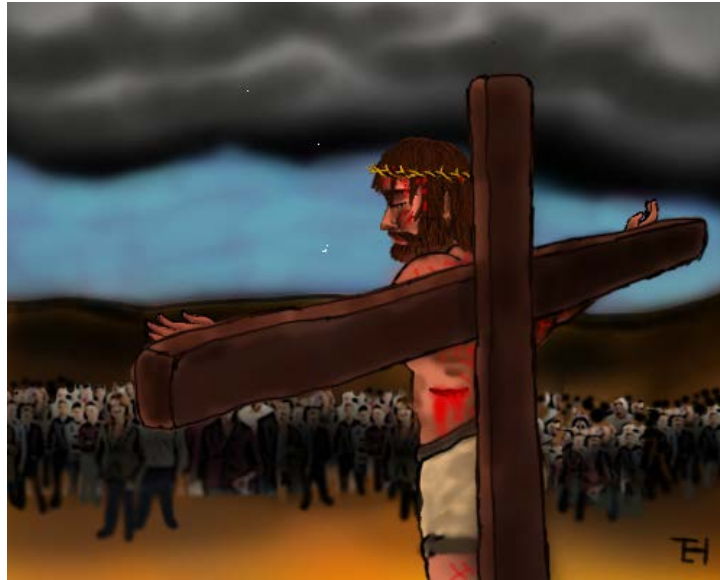
Christ died for sinners!

I John 4:10 Yaawaa koŋŋaa naa yaa n koŋŋi Kɔraawiizi naa ɛɛ pɛɛɛ. Ka Kɔraawiizi koŋŋaa naa un koŋŋi yaa naa, waabuu koŋŋaa himmaa. U hum u biere durnya u ba di wa siu ú wer lizi u baŋŋ yaa ni.