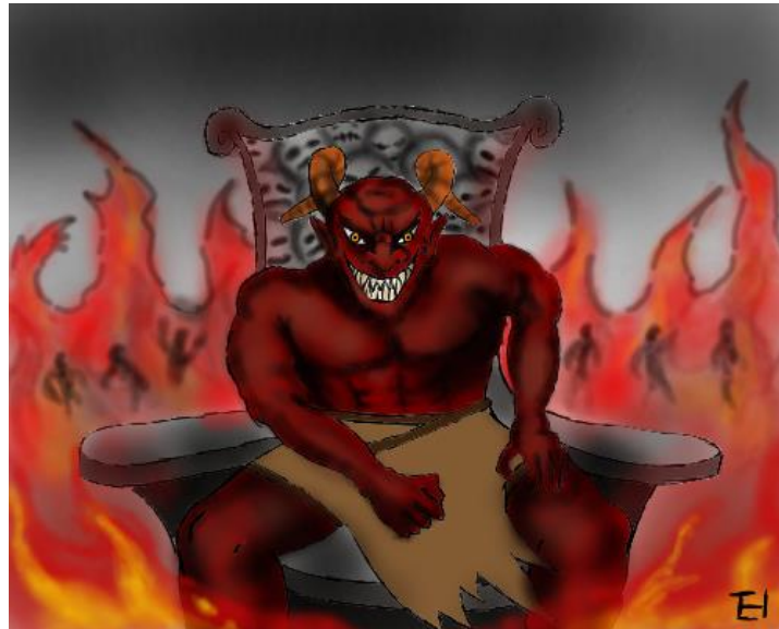
There is a cost for sin!

John 3:36 መገን ቤቶን አመዕነኖ ዶሊ ሆረንከ ሄአ ሄቸተ ደቀኖ። ቤቶን አመዕኑምበሀን አሌን መገን አሙርት ድርታስ በጋን ዶሊ ሆረንከ ሄአ ሄቸተ ደቀኖበአ።