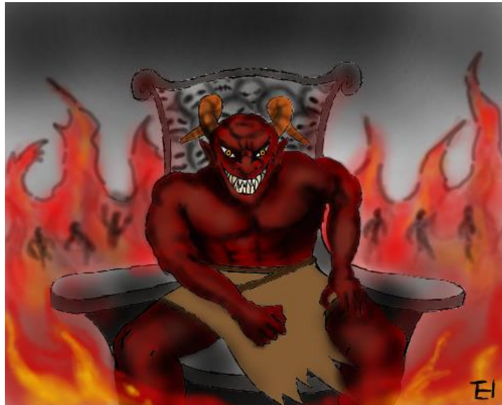
There is a cost for sin!

John 3:36 ጸ . ጋ ኤተ ከምገሚል ከዱ ረባ፣ ከምጫ መኢያ አል ግዢ ግዢ፣ ኤተ ከምኮዎቆ ዱማኸን ከምጫኹ መኢያኹ፣ ከምኢያ ማመሠ ረባ ነጸ . ገማ።"