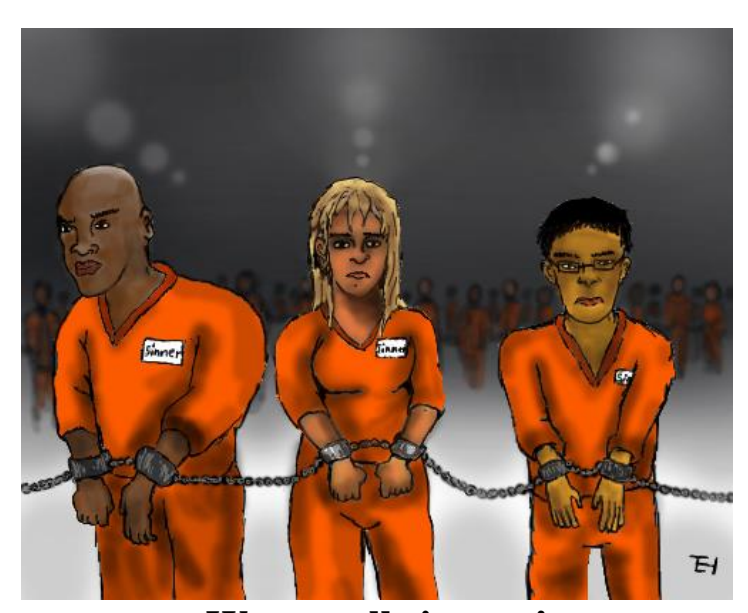
We are all sinners!

Abaroomu 5:12 Esibi syeecha mu syaalo nisibitira mu muundu mulala, handi esibi syae syaleeta ohufwa. Esyatulamo, ohufwa hwasalaana hwoola hu buli muundu, olwohuba abandu boosi bahola esibi.