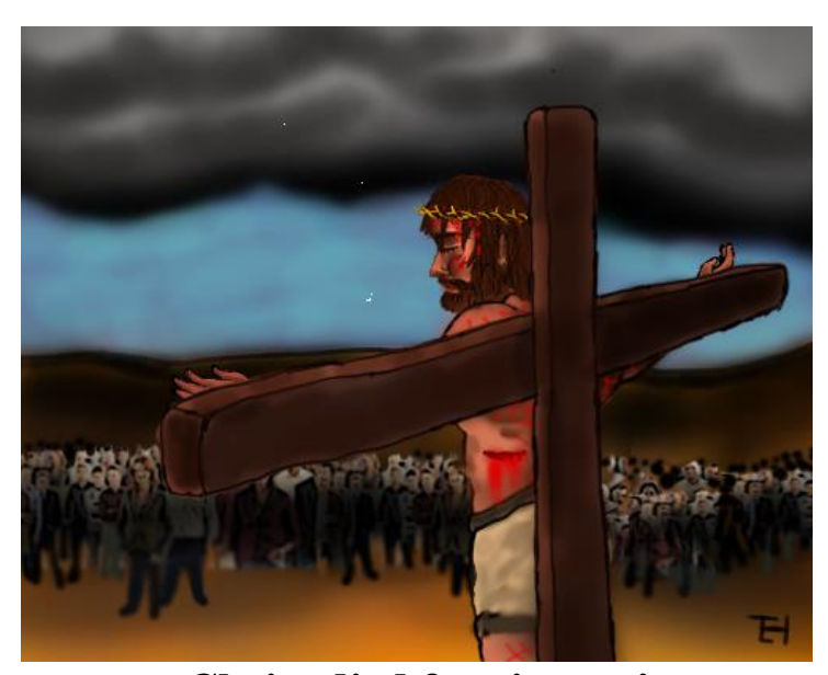
Christ died for sinners!