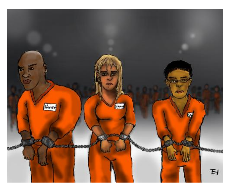
We are all sinners!

Romans 5:12 Nk'oku ekibi kyaizire omu nsi ahabw'omuntu omwe, ekyo kibi kikareeta okufa; nikyo rufu yaahikiire aha bantu boona, ahabw'okuba boona bakashiisha.