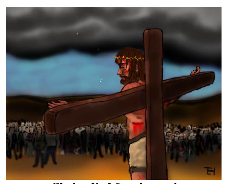
Christ died for sinners!