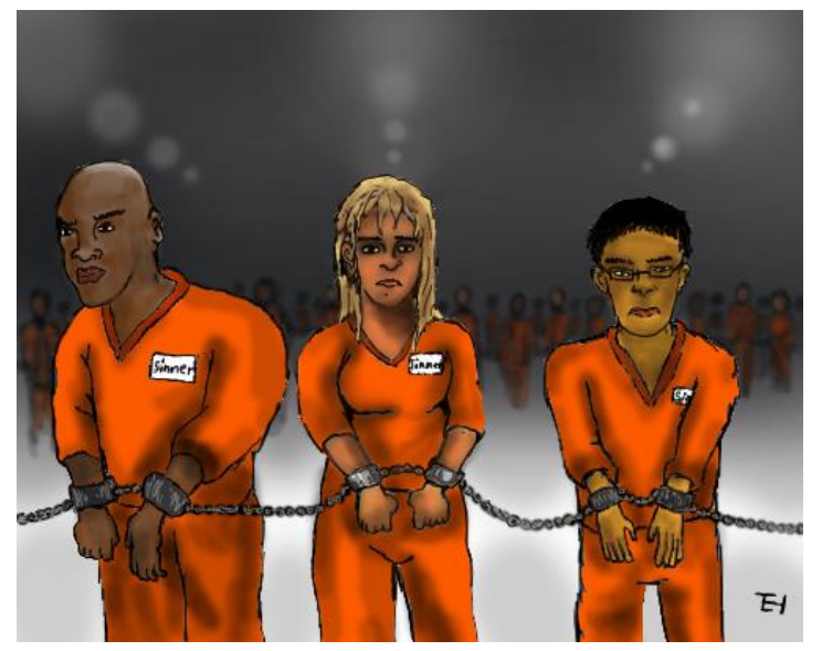
We are all sinners!

Jurumi 5:12 Ka kumeno, calu ni kum ng'atu acel dubo mondo i ng'om man tho ni kum dubo, e kumeno tho kadhu ba dhanu ceke, kum kagi ceke gidubo: