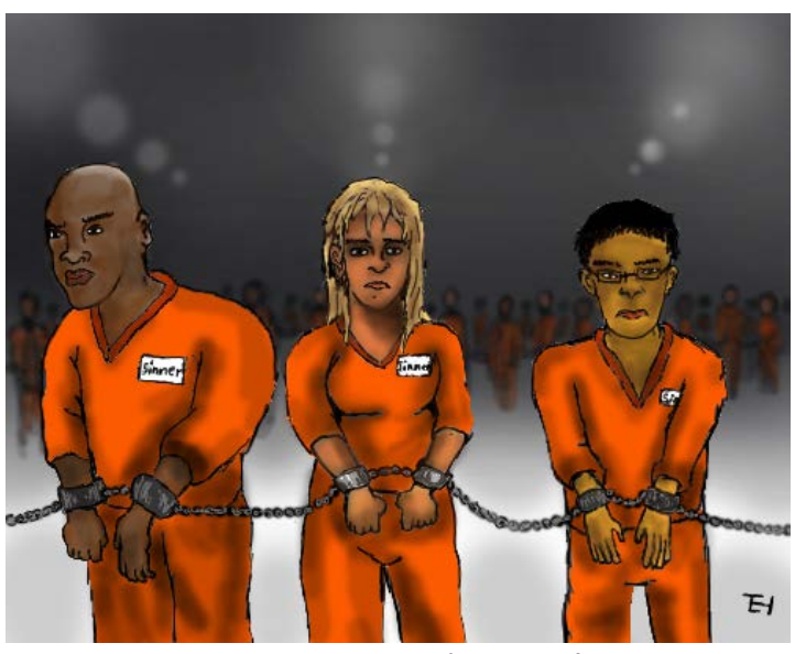
We are all sinners!

John 3:19 Alaloda innokena. Leleda lagata koke, id eke miniye bayeno leleda kin somasi komei kokke.