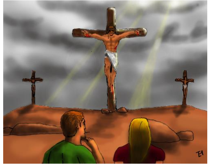
Why did Jesus die?