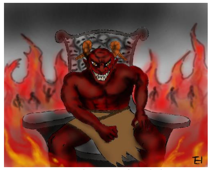
There is a cost for sin!

Yohana 3:36 Ojwanhwamini Mwana akweti bwomi gwa machoba goa pangapela, jwangannyali Mwana aibeje na bwomi gwa machoba goa pangapela, nambu kuchimwa kwa Nnoongo kuba kunani jakwe.