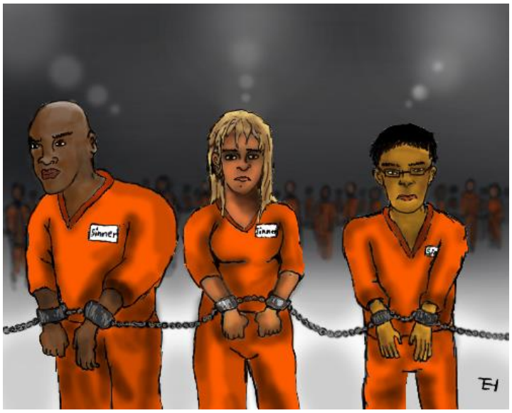
We are all sinners!

Akaloma 3:23 bandu boa balemwite na babi kutaali na kibumo cha Nnoongo.