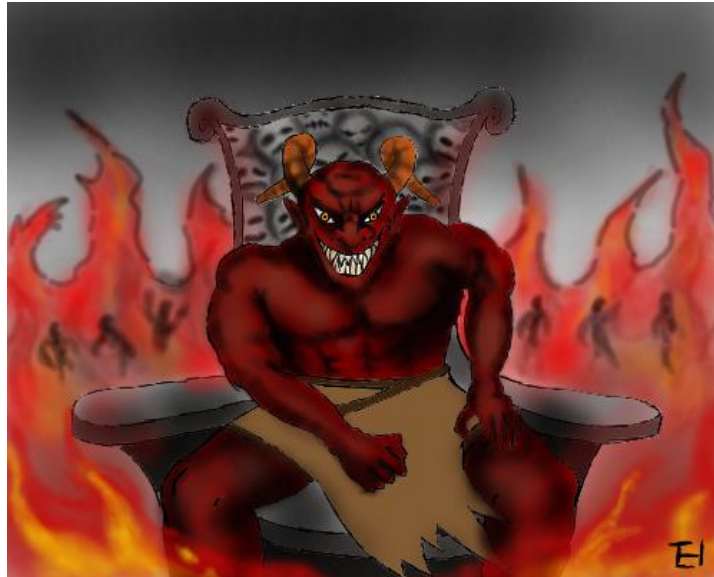
There is a cost for sin!

John 3:36 ናዓሢ ጉሙርቂ ዔከሢከ ናንጊና ናንጊ ዓኣኔ፤ ናዓሢ ጉሙርቂ ዔኩዎአሢ ጋዓንቴ ያኦሲ ዲንጋ ሜቶይዳ ናንጋንዳኦጋዓቴም ከሺ ናንጊ ዴንቃዓኬ» ጌዔኔ።