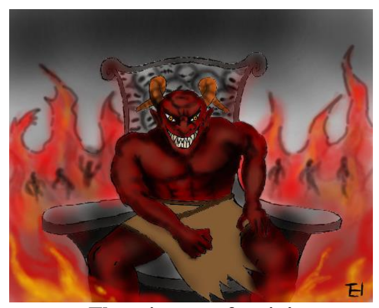
There is a cost for sin!

Jon 3:36 Onen wanwanaya wa obi yooyi Ween ka lotumajau na oyeni etoom ayoyowa. Onen wanwanaya wa obibi Ween wa Obase ka lotumajau ooyooyi, etoom ooyeni, oda lotama ja Obase na loyau oba nwa ka ayoyo."