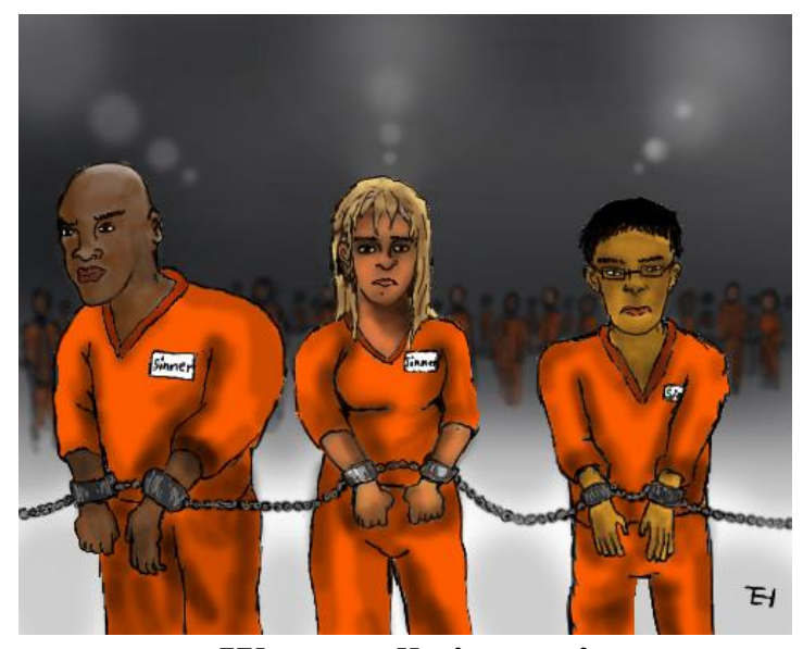
We are all sinners!

It is not hard to admit that we all have done things that we know is wrong, but yet we do them anyway. That is called sin! We all are guilty of it we have been doing it since we were born.