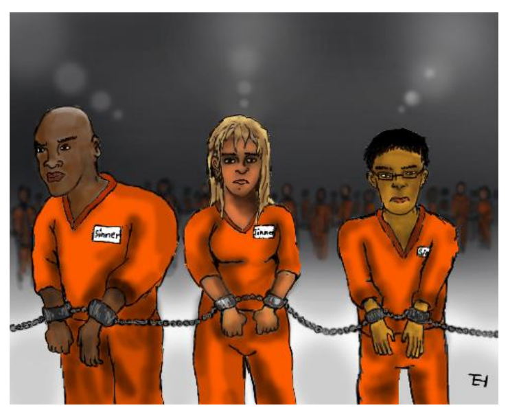
We are all sinners!

Romebi 3:23 Nkpal mans so, ekama nyam wora kulubi a man taga to Ebors be kemankura na.